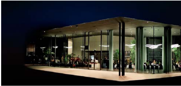
Congresspark Igls Eugenpromenade 2 6080 Igls